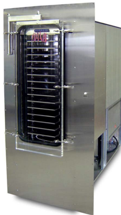
Cleanroom configuration shown.

Note: Other electrical configurations available.