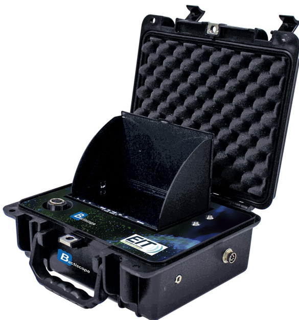
Bactiscope™ turned off

EIT International's Bactiscope™ inspection cameras give you the freedom to inspect and investigate areas that would normally be inaccessible for standard cleaning and inspection protocols. Fundamentally, the Bactiscope™ is a miniature camera, or probe, on a flexible cable that can be manoeuvred into awkward areas such as pipework or behind hard-to-reach areas. The Bactiscope™ has a single camera head and Bactiscan™ light with an external diameter of 37mm, that then transmits a video feed that allows you to see a close-up, real time view of inspection areas.